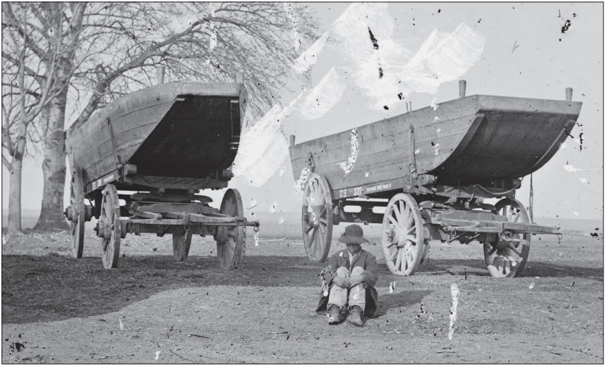
Two types of Federal wooden pontoon-boats on their carriages.